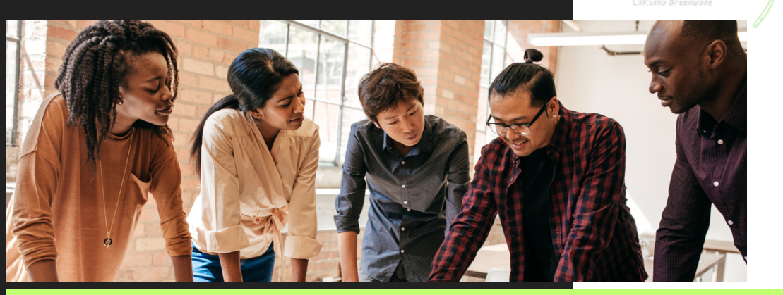
Empowering Founders and Leaders with Growth Strategies that Fit Them. They'll call You Lucky.